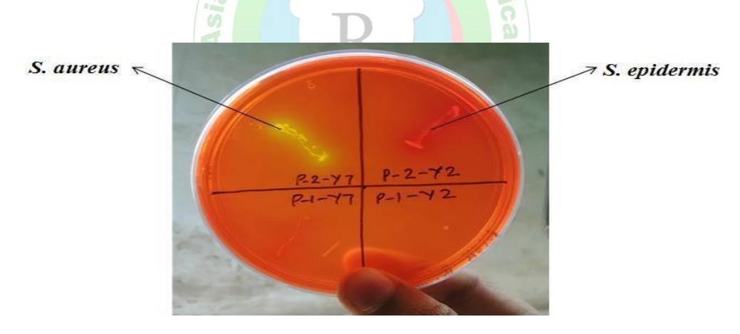
Figure 2: Strains of S. aureus and S. epidermis on MSA

strain from the plate was inoculate in the nutrient broth and then the inoculum was left for 1-2 days at 30°C in the incubator. After the growth of bacteria in the broth, it is used to perform the disk diffusion method with the given cinnamon plant sample.