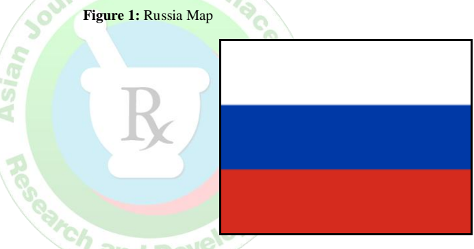
Figure 2: Flag Tricolor and Emblem

Before, explaining on Russia market, it is critical to discuss about sociodemographic aspects. Russia is a land of superlatives. By far the world's largest country, it covers nearly twice the territory of Canada, the second largest. It extends across the whole of northern Asia and the eastern third of Europe, spanning 11 time zones and incorporating a great range of environments and landforms, from deserts to semiarid steppes to deep forests and Arctic tundra. Russia contains Europe's longest river, the Volga, and its largest lake, Ladoga. Russia also is home to the world's deepest lake, Baikal, and the country recorded the world's lowest temperature outside the North and South poles. The inhabitants of Russia are quite diverse. Most are ethnic Russians, but there also are more than 120 other ethnic groups present, speaking many languages following disparate religious and cultural traditions. Most of the Russian population is concentrated in the European portion of the country, especially in the fertile region surrounding Moscow, the capital. Moscow and St. Petersburg (formerly Leningrad) are the two most important cultural and financial centers in Russia and are among the most picturesque cities in the world <sup>5, 6</sup>.