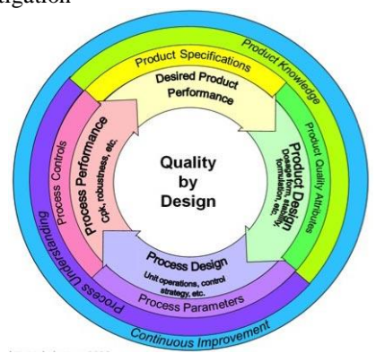
Figure 1: Quality by Design model