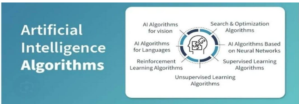
Figure 2: Artificial intelligence algorithms

really improvement specification - based through pharmacy technician besides delivering true additional insight [15] .