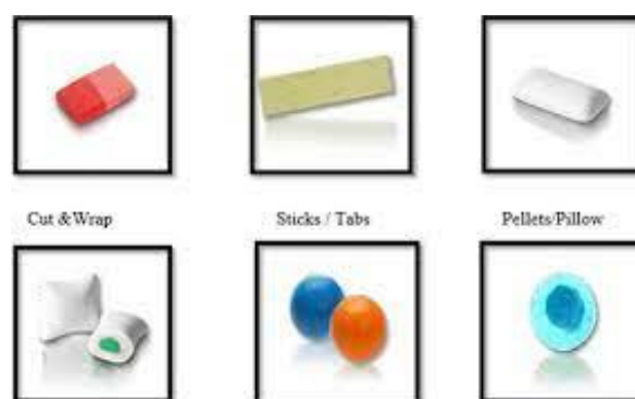
Figure 04: Types of Chewing Gum