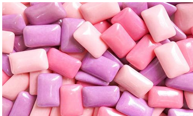
Figure 02: Medicated Chewing Gum

Medicated chewing gum (MCG) is a new drug delivery system containing a chewing gum base with pharmacologically active ingredient and intended for use for the local treatment of oral or systemic diseases absorption through the oral mucosa. The MCG is considered to be vehicle or drug delivery system for administering the active substance principles that can improve health and nutrition. Medicated chewing gum is a solid or semi-solid dose in a form that consists of one or more active ingredients (water soluble or insoluble) incorporated into water insoluble base. Many scientific studies have investigated the role of chewing gum in supporting healthy teeth. Rubber chewing is a common habit in many countries. (8) Initially, sugar was used to sweeten chewing gum, which led to dental cavities. Today, however, sugar substitutes (polyols) are used to sweeten more than half of the chewing gum sold in Europe. Clinical data indicates that chewing gum without sugar does not cause caries because the polyols do not cause a clinically significant amounts of metabolic acids to be produced in tooth plaque. This systematic literature review aims to evaluate the available data about the potential therapeutic or anti-carcinogenic benefits of sugar-free chewing gum for individuals. With potential applications in pharmaceuticals, over-the-counter medications, and nutraceuticals, MCG is the newest system (10,11) .