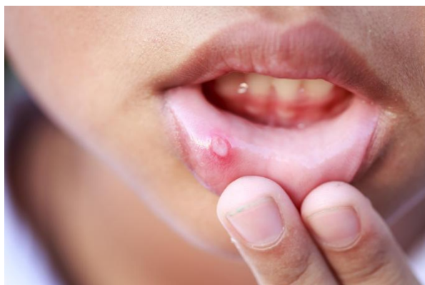
Figure 01: Mouth Ulcers

Immediately after quitting smoking you may get mouth ulcers. This is usually temporary.