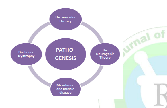
Figure 1: Numbers of theory which further develops DMD in patient.

Dhuchhne muscular dystophy is caused by completely absence of dystrophin protein in muscle and found in sarcolemma of muscle fibers and it's divided in 4 parts i.e.The Cerminal domain- it's common for joints others proteins in membrane it's called the dystroglycan complex, The Rod domain, The Cystein rich domain and N terminal domain.<sup>11,12</sup> These all types of domains bind with actin and postulated that dystrophin is essential to transudate of the contractile required to outside of cell matrix. Additionally, DMD caused by muscle fibers or completely absence of cytoplasm protein and further lead to damage to mechanical scleroma or loss of calcium level in body or loss of the muscle fibers.<sup>13,14</sup>